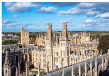
Oxford remains a top institution for research but has been topped by Leicester in the clinical field

=6 Oxford =6 Liverpool School of Tropical Medicine =8 King's College London =8 Institute of Cancer Research 10 Edinburgh