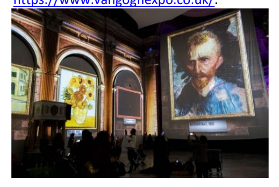
Van Gogh: The Immersive Experience

Admission prices are £13 for adults, £11 for concessions and students and £9 for children. Family tickets are available for £38 (two adults and two children). Discounted rates are available for school or community groups and quiet sessions will be held throughout the run to encourage visits from people with special educational needs. Tickets can be bought via the website <a href="https://www.vangoghexpo.co.uk/">https://www.vangoghexpo.co.uk/</a>.