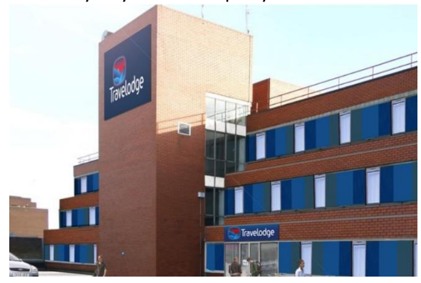
The proposed Travelodge at Leicester's Haymarket Shopping Centre

The project will support the regeneration of the key city centre site and the city council has secured a 125-year-lease on Haymarket House, sub-letting the refurbished building to Travelodge. As part of the scheme the city council has carried out a major £1.8million refurbishment of the Haymarket car park, with new surfacing, wider parking spaces, new lighting and improved pedestrian walkways. A new automatic number of plate recognition system and improved CCTV security will also be installed as part of the refurbishment. The city council has extended its lease on the car park – which is owned by Haymarket Property Ltd – until 2049.