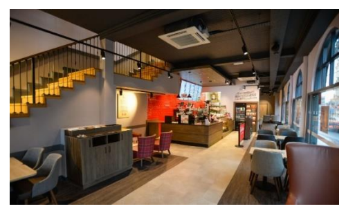
First look at Tim Hortons, Leicester

opened in Glasgow in June 2017, with fans travelling from across the country and queuing overnight to sample the brand's coffee and baked goods.